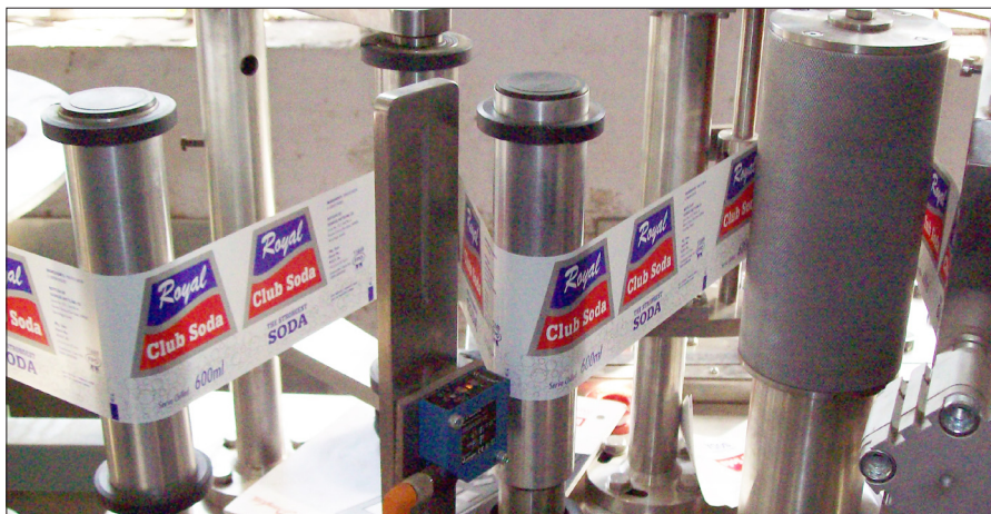
On the cutter roller a zero mark sensor is mounted, and on the feed roller a print marker sensor.

The machine can label 100 bottles per minute.