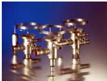
TU series thermostatic expansion valves

Also available at all stocking distributors are the ever more popular Danfoss TU series expansion valves. With fast installation (no wet wrap needed), precision, and repeatability, valves in the TU series valves feature: