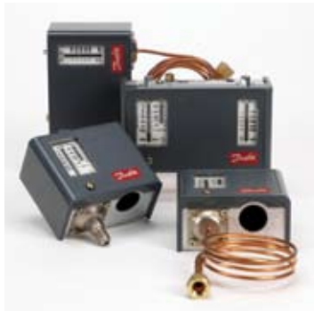
KPU pressure controls & thermostats