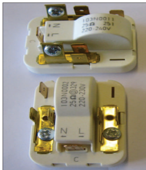
Fig.2 Example: PTC starting device 103N0002 to be replaced by PTC starting device 103N0011