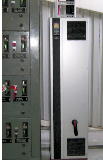
VLT® FC 302 in operation

Once again Danfoss provided a fast and secure return on investment, in this case by means of the electrical energy savings, thus contributing to the environment and making a significant improvement in Bimbo's carbon footprint..