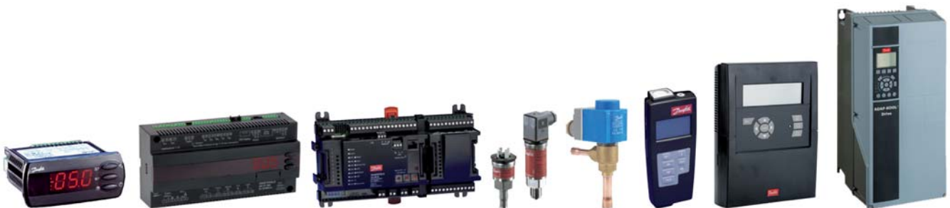
The Total solution of ADAP-KOOL® Next Generation

In addition details of our products, news and information can be found on our web site www.danfoss.com/foodretail