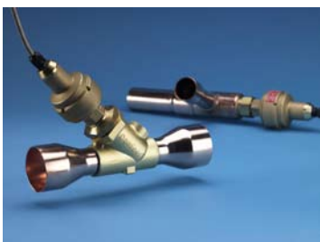
KVS EPR valve

EEPR valves are gaining popularity due to their outstanding temperature control and energy efficiency. Danfoss KVS 42 and KVS 54 straightway valves are available with 4 widely used connection sizes. With their bi-directional balanced port design and solenoid-tight shut off, these valves provide the benefits of quality and outstanding Danfoss engineering.