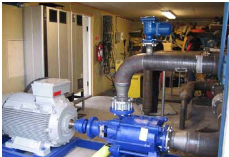
Installed 200kW VLT® AQUA Low Harmonic Drive controlling a new feed pump and maintaining a constant flow of water through the hundreds of meters of pipes