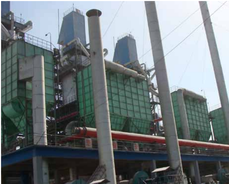
The new Erdos plant in Inter-Mongolia, China produces 600,000 tonnes of calcium carbide per year under extremely severe conditions.