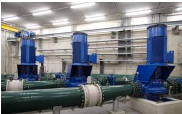
The pumping room is placed under the ground level. The very carefully made installation is realized by Deckx Werkhuisen n.v.