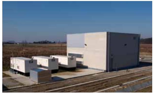
There is a low level of noise generation outside the building because of noise absorbing exhaust ducts.