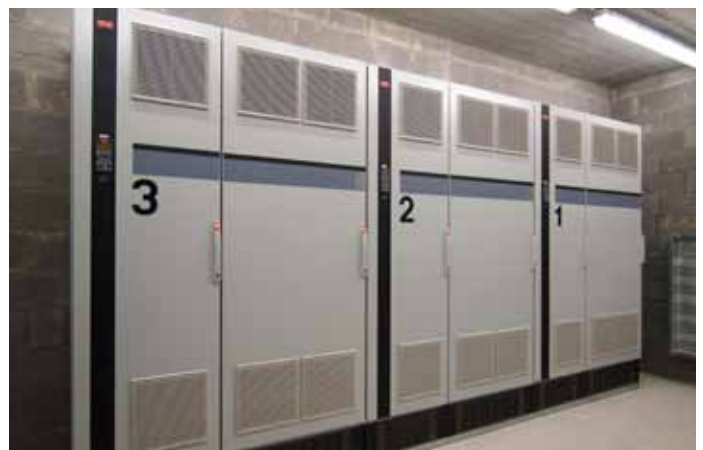
The 3 x 500 kW VLT® AQUA Drives standing side by side. The room is just wide enough to contain all three.