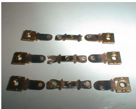
Here we can see the type of damage that has occurred to the contacts inside the contactor after a compressor failure.

It is often the case that after a compressor failure the contactor itself is also damaged. This will result in the contactor either not working at all or not working correctly. In this situation some engineers have condemned the new compressor has being DOA (Dead On Arrival) or the new compressor has been fitted and then suffered catastrophic damage and itself needed replacing.