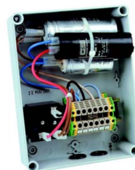
Single phase starter kit. This should always be replaced when fitting a new compressor.

Always make sure the system isolator is switched OFF and fuses removed before carrying out testing of this nature.