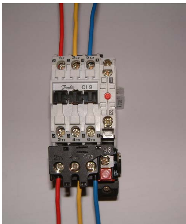
3-Phase This contactor is wired to the older UK standard, however, it still illustrates the correct wiring of the 3-phases. With the new European standard the Red wire would be replaced with a Brown wire, the Yellow wire would be replaced with a Black wire and the Blue wire would be replaced with a Grey wire.

L1 = Black or Brown L2 = Black or Brown L3 = Black or Brown Neutral = Blue Earth = Yellow/Green