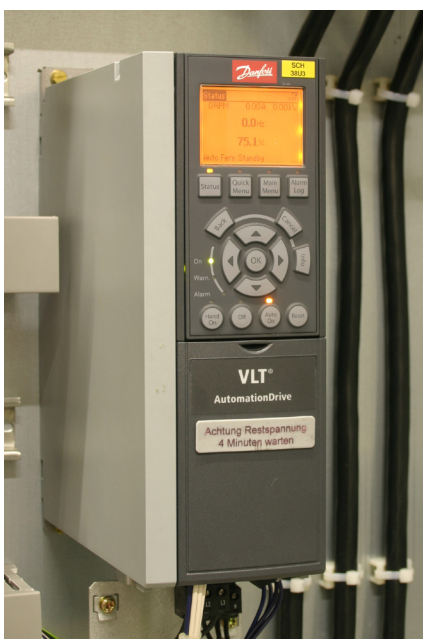
The Danfoss frequency converters from the VLT® AutomationDrive FC300 family.

With this form of parameterisation, Danfoss managed to eliminate a mechanical overload coupling on the output shaft of the gearbox for torque limiting, which had been planned into the design. Now if a foreign object is located in the grinding gap while the rolls are being moved together, the motor will apply the reduced maximum torque level and then remain still. With their electronic overload coupling, the Danfoss specialists not only achieved a very economical solution but also created additional installation space, because the new drive unit is considerably more compact. With the VLT® AutomationDrive FC300, the Bremen-based coffee roasters can always control their grinding process with micrometre accuracy because Danfoss has the optimum drive, even for drive systems rated at 20 times less than usual.