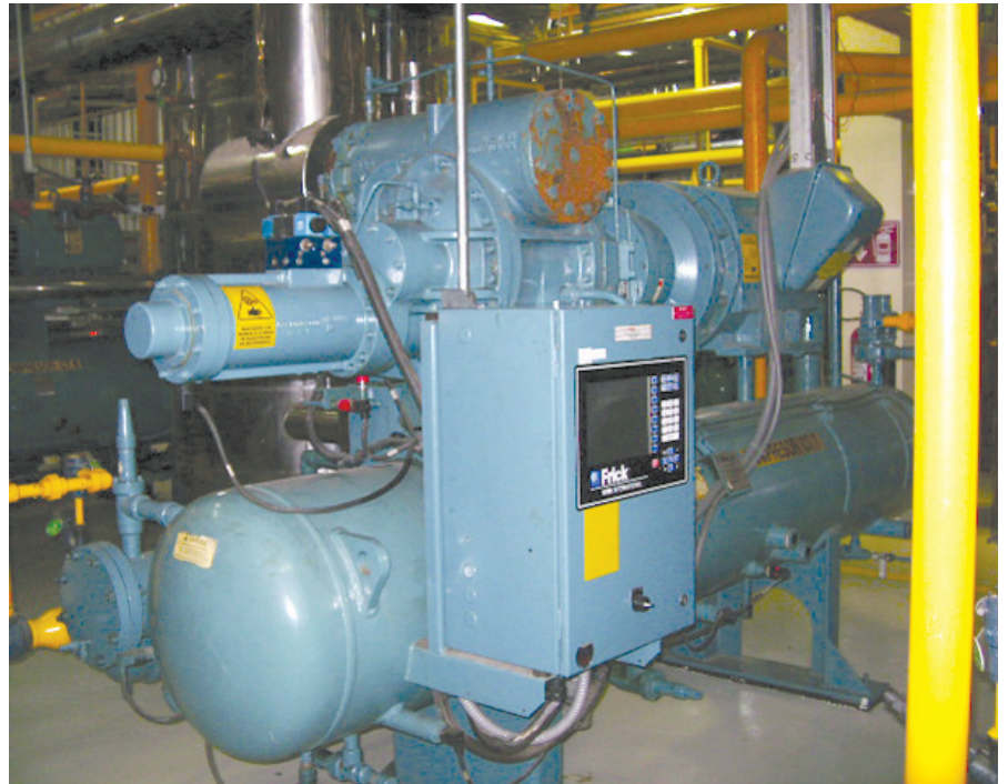
Screw Compressor 200 kW CT7

Hazpan plant and granted Danfoss authorization to implement an energy saving system on one of its ammonia compressors. In this case, a 200kW CT7 Frick screw compressor, which represented an excellent opportunity for energy savings, due to the large number of compressor units installed in Bimbo plants, and owing to their requirements for motors.